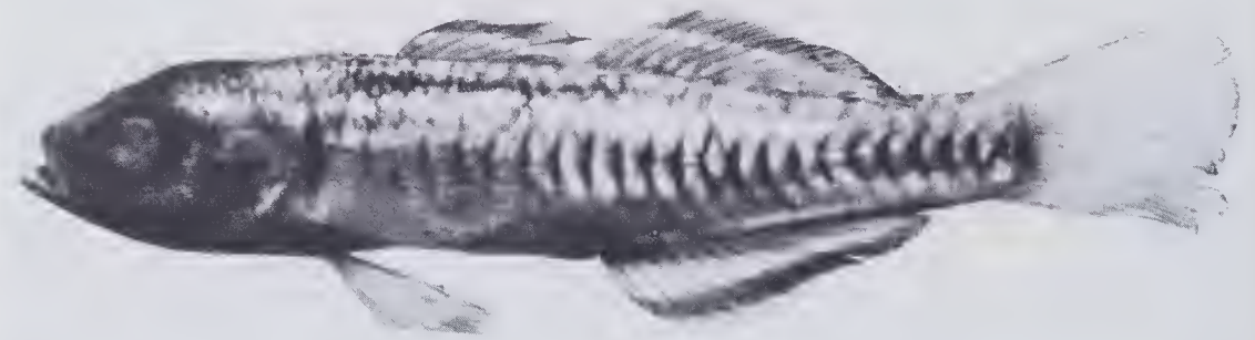
Figure 4 Hypseleotris regalis , male holotype, 32 mm SL, Wyulda Creek, Western Australia.

followed distally by a thin white stripe, followed distally by a broader black stripe; extreme distal tips white.